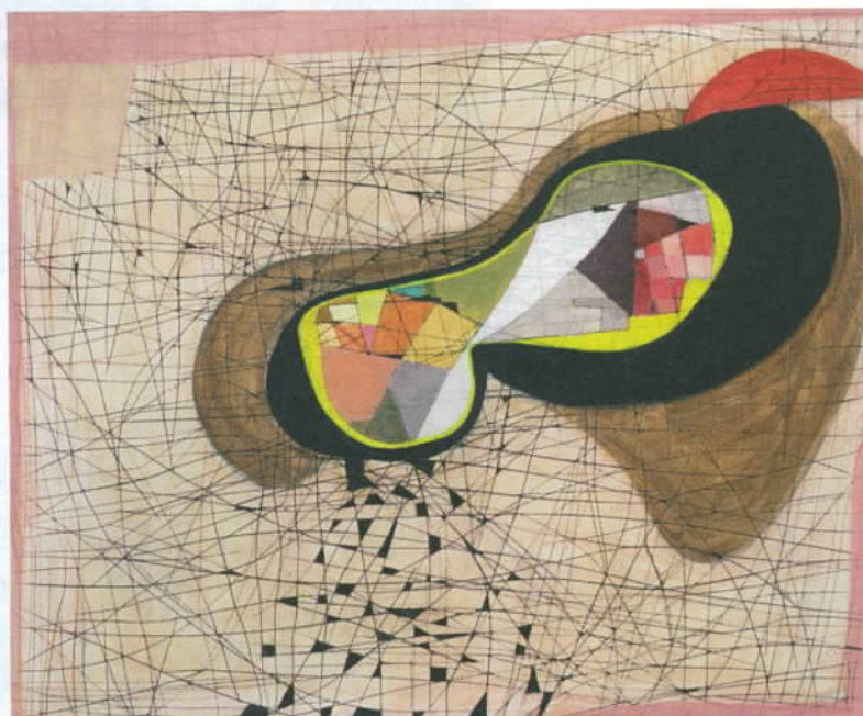
Double Trouble, 2017

"When I'm in the studio I'm focused and I'm very clear. I mean, I think when you've been painting for over 50 years... you know all of the ... not all perhaps, but I know a lot of things that I shouldn't do to make a good painting, and clearly one of my passions is experimenting with different tools. I think those tools are ... different tools bring out different emotions. So, if I'm in a particular place and I'm feeling a certain way, I want to express that — I go to the tools that I think are going to express it best. It's just all intuitive. When it feels right, it just feels right. I know