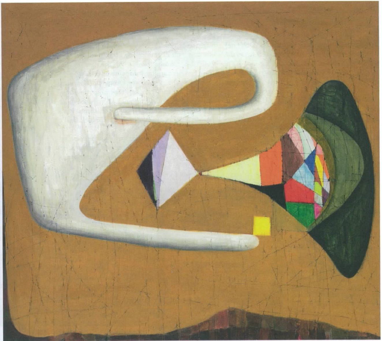
Balancing Act, 2018

“Every painting starts with scratches embedded in the surface. From there it becomes a totally intuitive journey where one shape of color informs another shape and another shape until it all comes together in a cohesive painting. I don’t always know what they are about or what they mean but what I do know is that they feel RIGHT. When that happens they have what is most necessary – heart, humanness, and a non specific narrative in which the viewer can find their own meaning.” – BRENDA GOODMAN